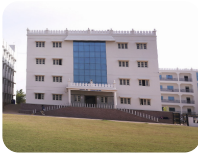
Hostels within the campus