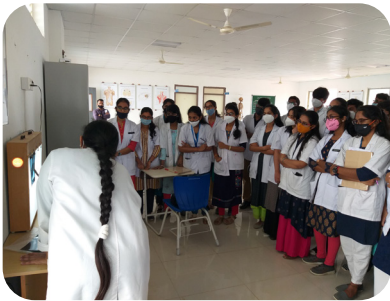
Internship facilities for students