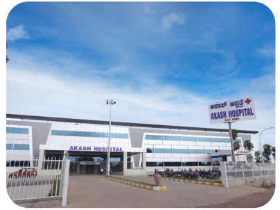
Students will get practical exposure in the Akash Hospital