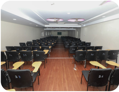
Lecture Halls/AV Rooms