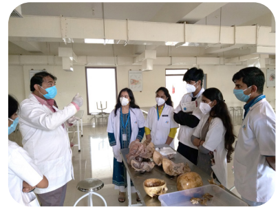
Department Specific Laboratories