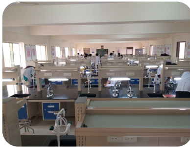
Practice in Akash Hospital in the Campus