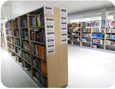
Central Library equipped with digital library